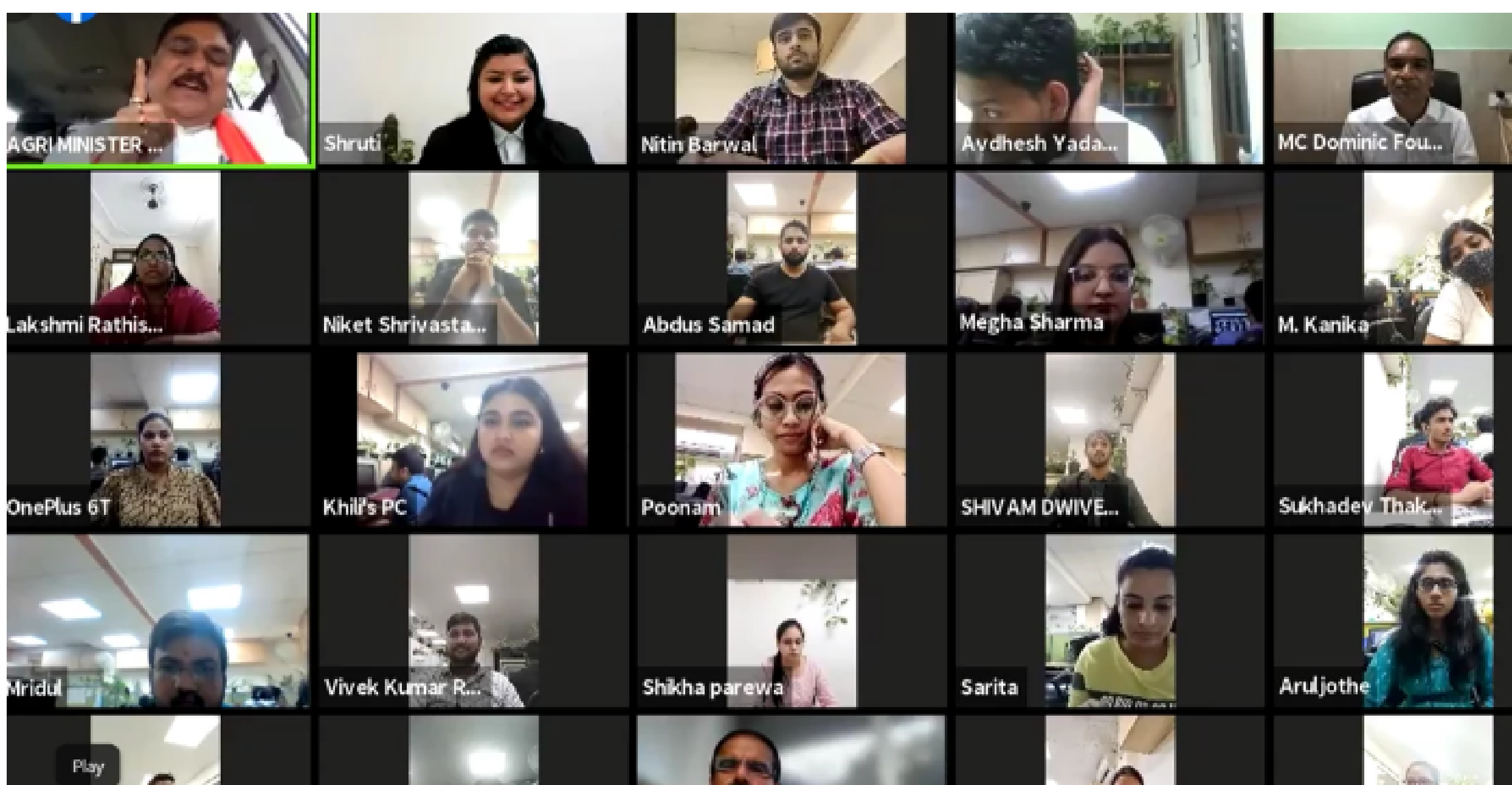
The launch Event of Farmer - The Journalist